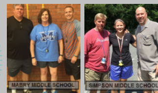
How did two Middle School PE Departments use SKYPE?