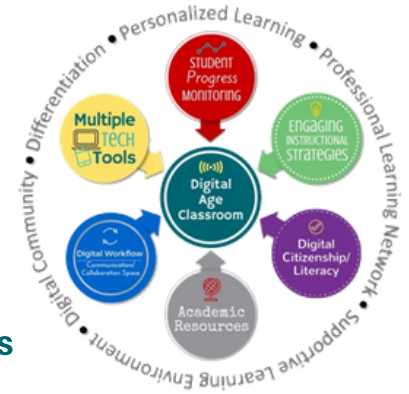
Click to explore our ThingLink